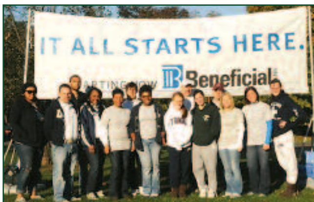
Some of our volunteers for the day at the starting line!

Proceeds from this event benefitted the Foundation of the Delaware County Chamber.