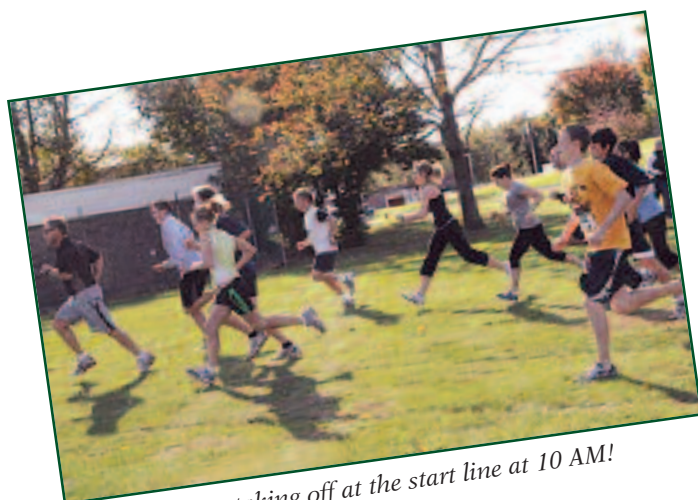
All the runners taking off at the start line at 10 AM!